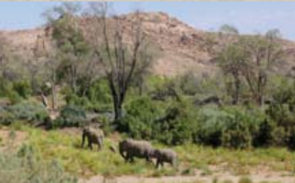
Scenes you will remember

We do not recommend to undertake a elephant drive with your own vehicle and alone. Never forget that they are wild animals and potentially dangerous.