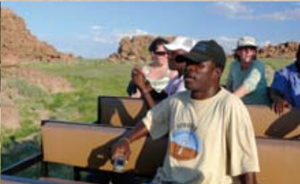
Scenic game & sundowner drives

The Ugab River valley, the Brandberg Mountain, the Damaraland with Doros and Messum Crater – there is a lot to discover in the area around the lodge.