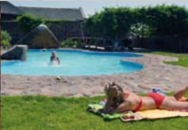
Relax in the pool area