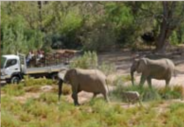
Close encounters included