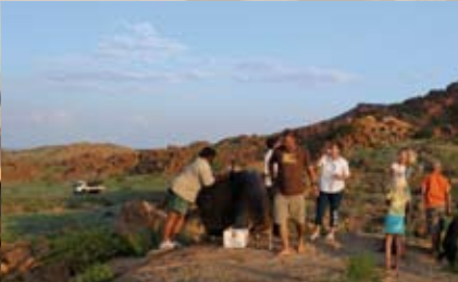
The Ugab river valley is a true paradise for bird and game watchers, hikers and other nature lovers