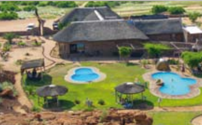
Welcome at our oasis

Here, at the foot of Namibia's highest Mountain, nothing has changed since the earth's early days. Clocks and watches are not part of this world. Here, you've got time. "Tranquillity" is name of the game.