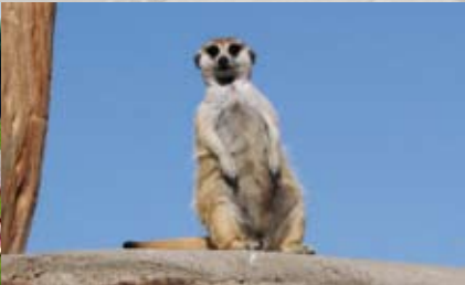
Everybodys darling: Carlos

The stone-age rock paintings of the San bushmen give evidence of the presence of the famous desert elephants in the area many thousand years ago.