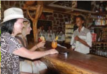
Bar and Lounge